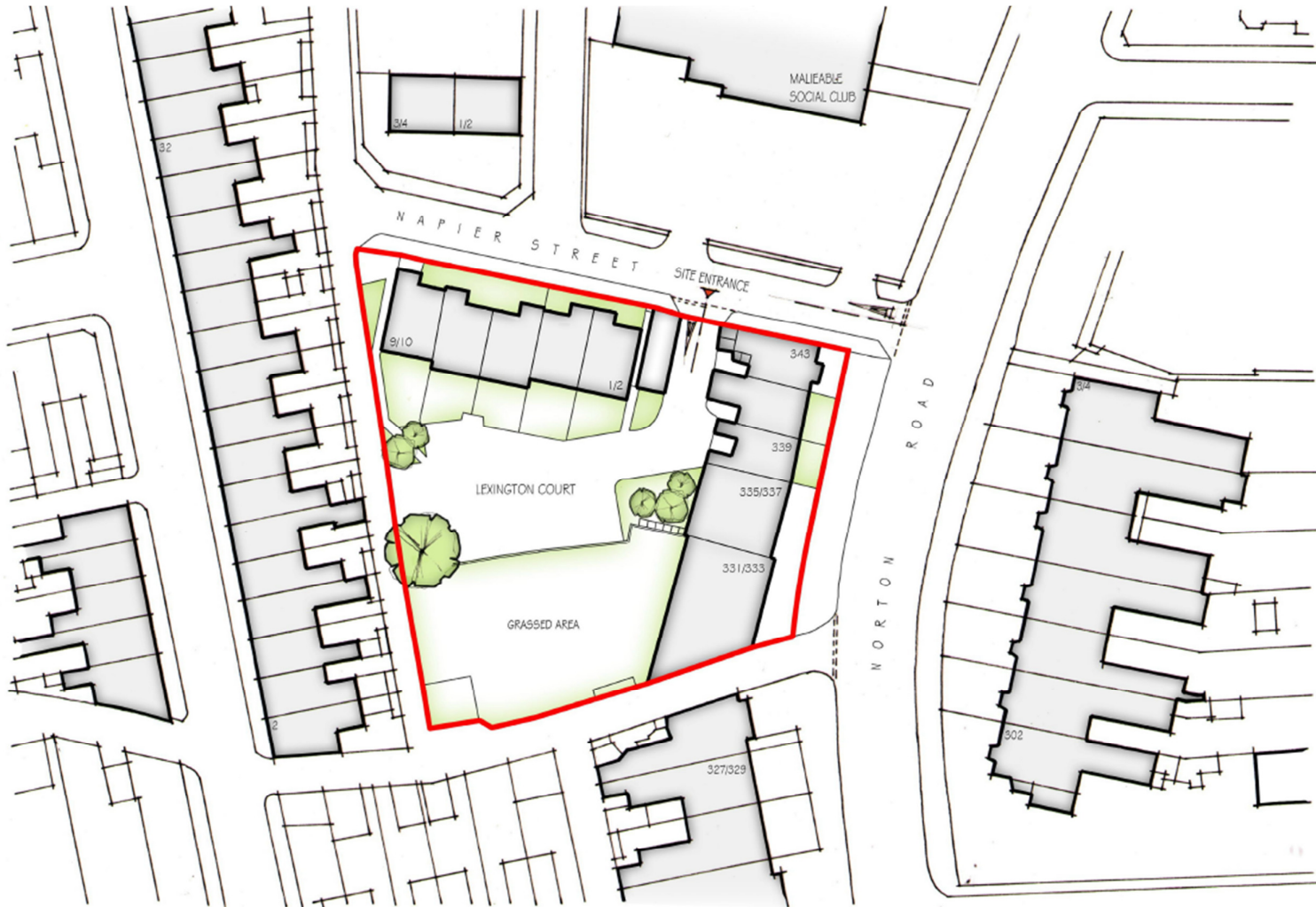
EXISTING SITE PLAN SCALE: 1:500