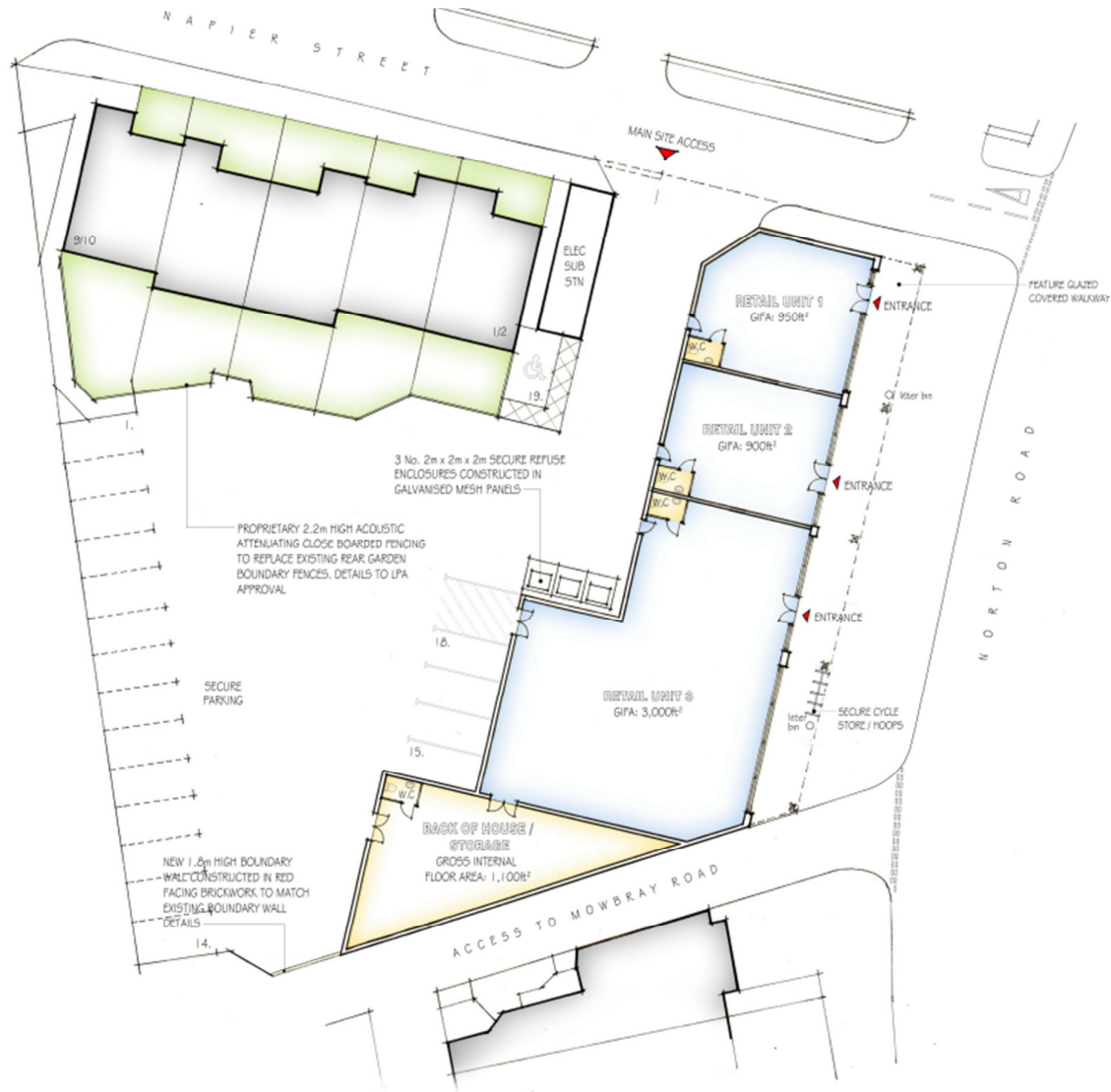
PROPOSED GROUND FLOOR PLAN SCALE: 1:200